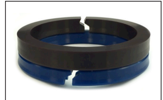
Split 11K set with dual material AWC800/AWC825 used in combination with a standoff ring for added stability and support.